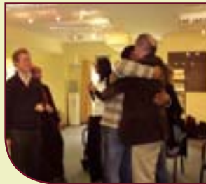
Trendsetter residential with Sheffield Black Drugs Service (SBDS)

"We're grateful for the support we've received through the Trendsetter support package and we hope we'll now go a long way"